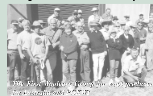
The First Woolcare Group for wool producers for Australia and PGKWI